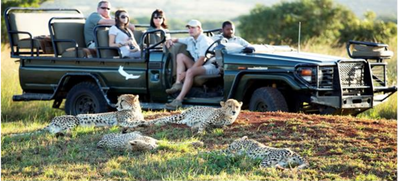
Safari in South Africa remains a top tourist attraction