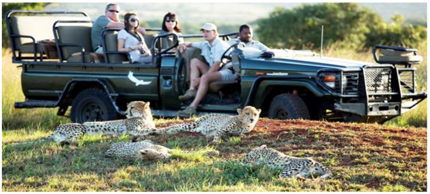
Safari in South Africa remains a top tourist attraction