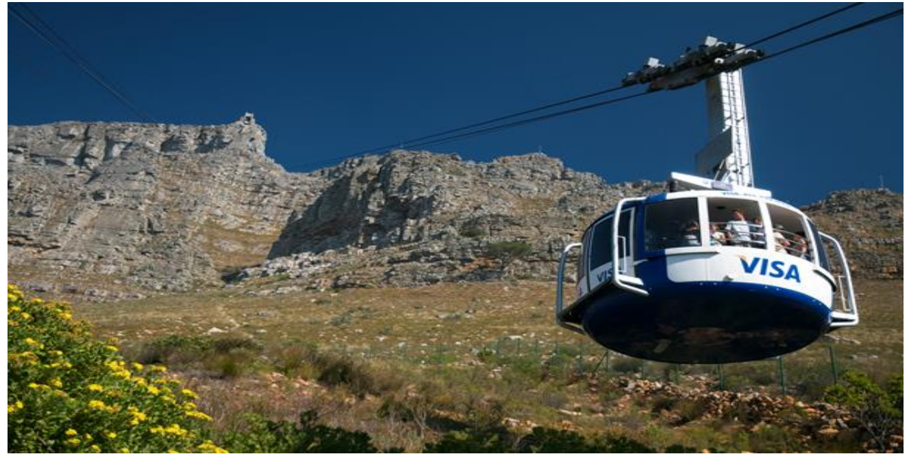
Cable Car to Table Mountain, Cape Town