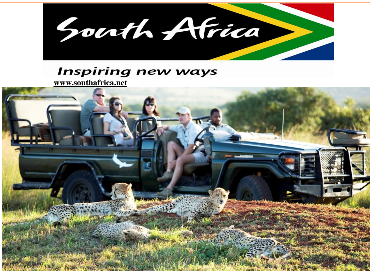
Safari in South Africa remains a top tourist attraction